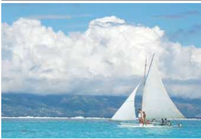
A traditional sailing canoe cuts across the Moorea lagoon. Yes, the water inside the fringing reefs really is that blue.