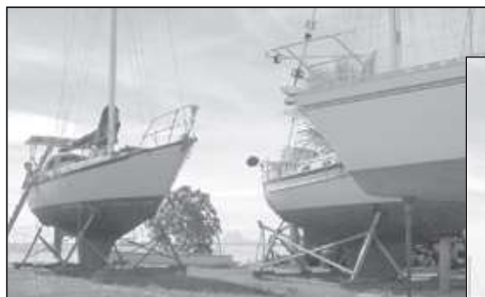
Large, fenced, secure dry storage area