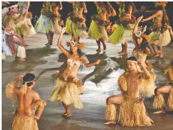
Every year in July the best dancers, musicians and athletes come to Tahiti to compete in a sort of cultural Olympics called the Heiva.

Cyclones are dependent on warm seawater in order to form, and due to the cooling effects of the