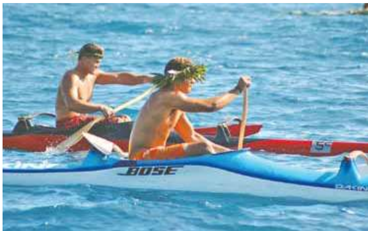
Outrigger canoe racing is the national sport. Every afternoon you can see strong-armed men and women practicing in the lagoons.

In El Niño years there are five secure options (fewer for multihulls): The Marquesas and Gambiers have never had