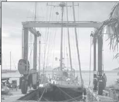
Professional boatyard in the heart of Paradise

Foreign Flag vessels can stay on dry storage in our yard for up to 12 months out of 24.